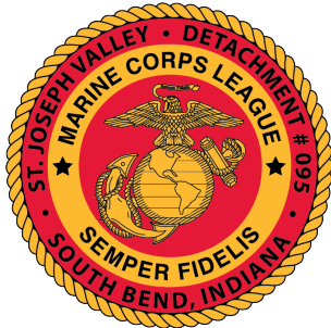
Marine Corps League Det 095